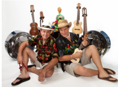
The Conch Fritters www.theconchfritters.com